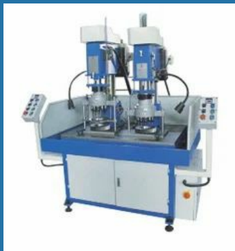
Hydraulic Drilling Machine