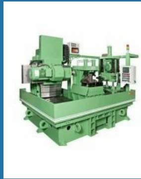
SPM Milling Machine