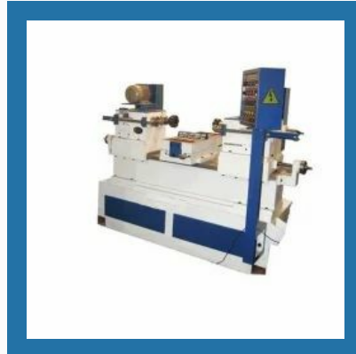
Center Facing Special Purpose Machine