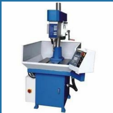
CNC Drilling Machine