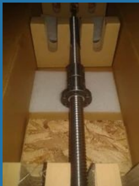
CNC Ball Screw