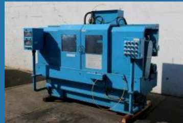
Facing And Centering Machine