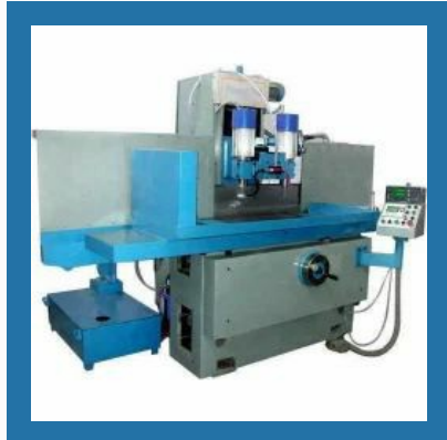
Cross SPM Machine