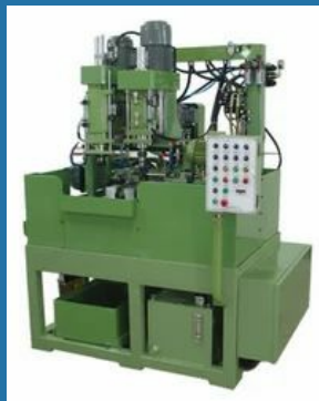
SPM Drilling Machines