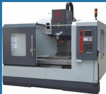
Cnc Turning Machine