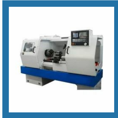
CNC Turning Machine