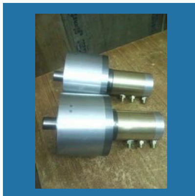
Hydraulic Rotary Cylinder