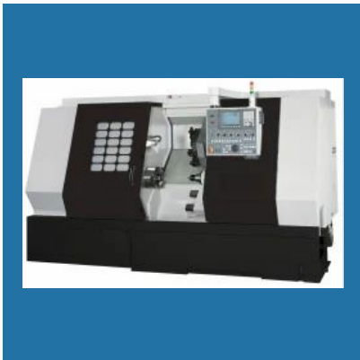
CNC Turning Centers