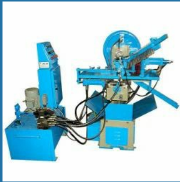
Hydraulic Milling Machines