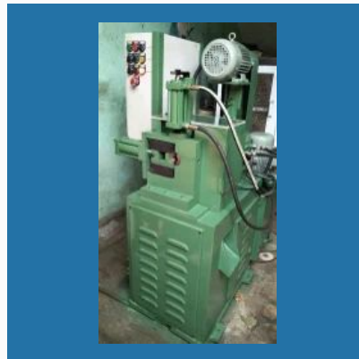
Rod Facing Chamfering Machine