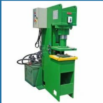
MS Stamping Machine