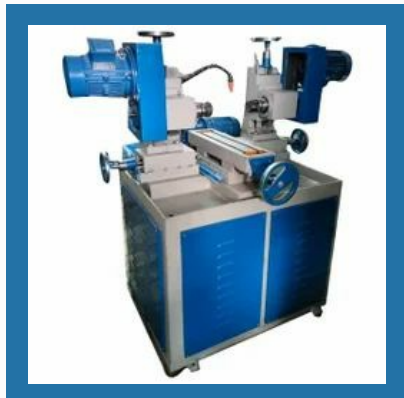
Facing Centering Machine