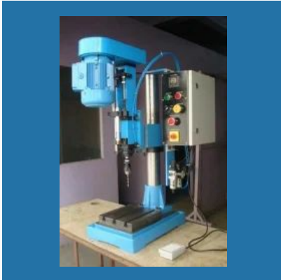
Auto Feed Drilling Machines