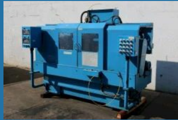
Facing Centering Machine