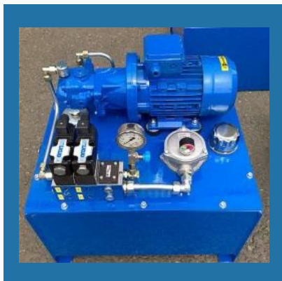
Hydraulic Power Pack