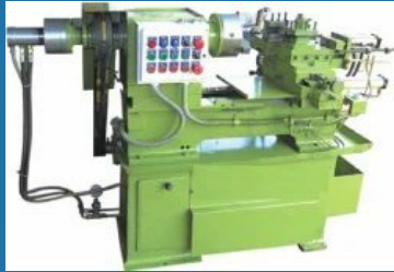
Facing Chamfering Machines