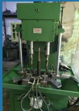
MS Hydraulic Drilling Machine